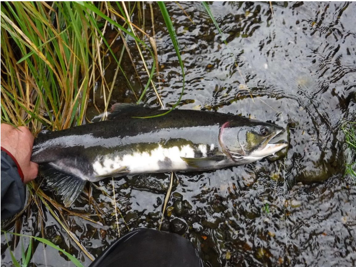
Figure 2.- Female Pink salmon at waypoint 3.