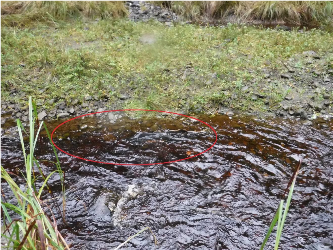
Figure 1.- 2 male Pink salmon behind a female, waypoint 2.