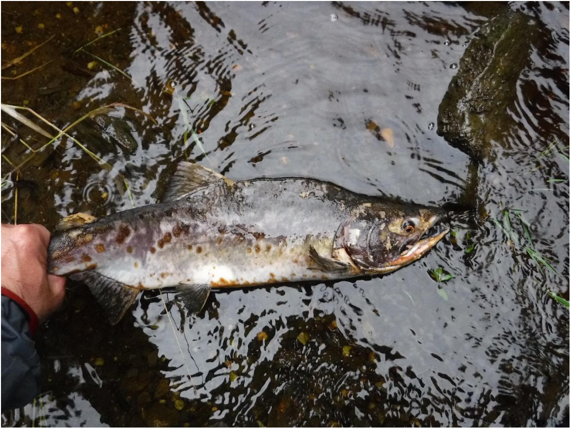
Figure 3.- Male Pink salmon at waypoint 3.